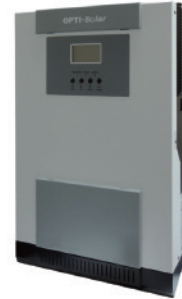
SP3000 / SP5000 Handy

Launched by OPTI-SOLAR, SP3000/5000 Handy and SP5000 Brilliant Ultra are embedded with MPPT PV charging controller, which could effectively obtain solar power. With "All-In-One" as the main focal objective of product design, it could obtain solar power, store energy and switch the output source through just one inverter.