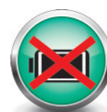
Able to Operate Without Batteries

Launched by OPTI-SOLAR, SP3000/5000 Handy and SP5000 Brilliant Ultra are embedded with MPPT PV charging controller, which could effectively obtain solar power. With "All-In-One" as the main focal objective of product design, it could obtain solar power, store energy and switch the output source through just one inverter.