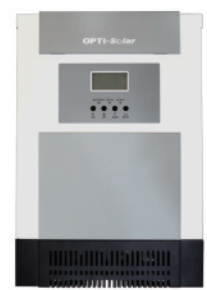
SP5000 Brilliant Ultra