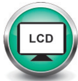
LCD Display Interface