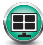
High PV Voltage input