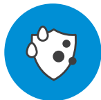
Anti dirt and damp proof