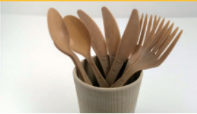
Sugarcane fiber knife, fork, spoon