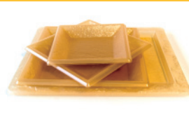
Sugarcane fiber blister stone patterned plate