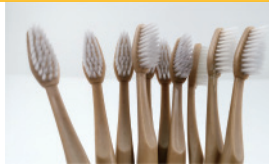
Sugarcane fiber toothbrush