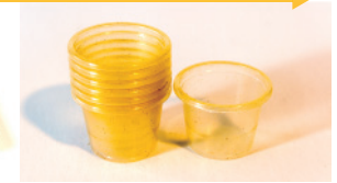
Sugarcane fiber blister cup, sauce cup