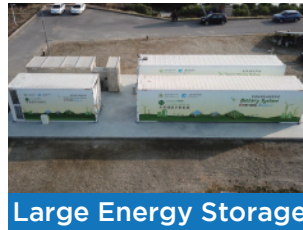
Large Energy Storage