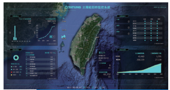
Real-time Solar Power Monitor

Through data statistics and analysis, they constantly regulate the system maintenance performance, predict the power trend, strive for multiple optimizations of the overall performance, system operation, and financial income.