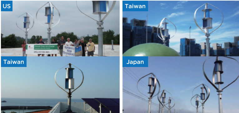
Comparison of Power Generation from Vertical and Horizontal Axis Wind Turbines

Horizontal Axis Wind Turbines Generate power with one directional wind exposure