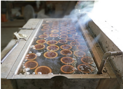
Manufacturing process of bamboo skin - simmering the bamboo tube

Mosia uses abundant and fast-growing natural bamboo forest materials without any danger of scarcity and adopts low manufacturing and low energy consuming way to produce bamboo flooring, which is easily naturally decomposed and fulfills the local industry sector characteristics. In addition, when pursuing the beauty of the original bamboo color, Mosia tries to combine colors with bamboo to develop pure natural dyes, and seeing the healthy concept as one of the important concepts of bamboo material design. Each step during the dyeing process is able to absorb the unique character of the bamboo which mutually affects and fused into each other. This is an exhibition that showcased vitality and has a whole new set of color concept and brings a unique bamboo color texture aesthetic feeling.