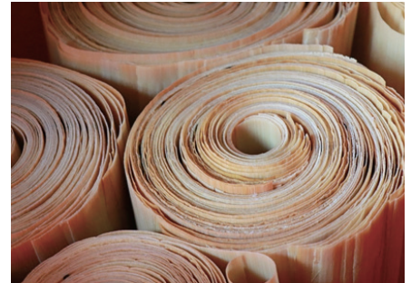
Natural bamboo skin after undergoing the drying process