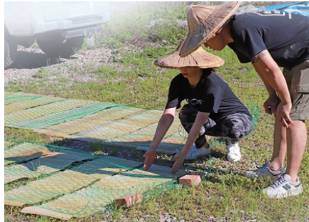
Natural lighting procedure that could expose the natural bamboo skin