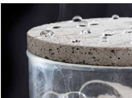
The Effect of LOTOS Multi-effect Waterproof Powder