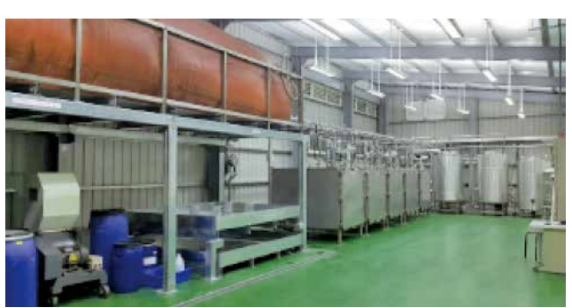
Dry Anaerobic Fermentation System

TXI Eco provides multiple solutions for agricultural circular economy. Dry Anaerobic Fermentation Technology, transferred from Industrial Technology Research Institute (ITRI), is applied to process agricultural waste, fruit and vegetable residue, poultry manure...etc. Organic waste can produce biogas through dry anaerobic fermentation, after desulfurized to generate electricity for thermoelectric application.