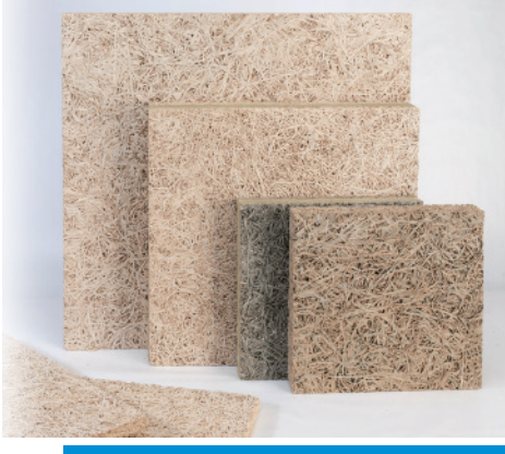
General View of Product Application