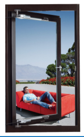
Projected-out Window with Electric Power and Remote Control

Projected-out window with electric power and remote control created by Jing Fa Aluminum comes with window screens and could be additionally installed with safety anti-pinch device, such as lattice or artistic iron windows. As the windows could be remotely controlled and the angle of the opened window could be adjusted and fixed, there is no need to open the window manually, and screens would not need to be opened, which lowers the chances of the expendable materials being damaged. This product has achieved the high performance soundproof standards for green building materials and fulfills the Weighted Sound Reduction Index(Rw)≧37dB, which in turn received the recognition of the green building materials mark. Additionally, the structure of the window has great air and water tightness, and excellent heat insulation performance that could let the indoor air maintain a stable temperature, achieving smoke exhausting and ventilation functions.